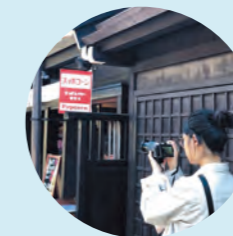
Field Trip (Kyoto, etc.)