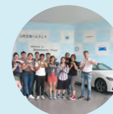
Factory Tour (Toyota Motor Corporation)