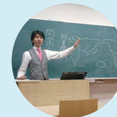
International Japanese Studies Class